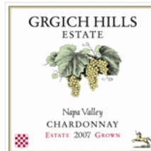
Grgich Hills Chardonnay

Glad you asked. In my experience, I have found Huge Bear Chardonnay , out of Sonoma ($40) to be a consistent show for Chardonnay in all of its oaked, malolactic glory.